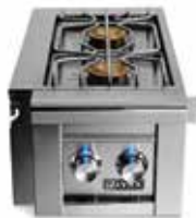
CART MOUNTED DOUBLE SIDE BURNER