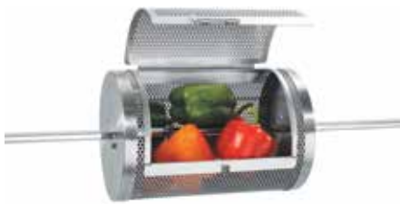
MODEL RB8 ROTISSERIE BASKET