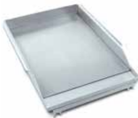
MODEL GP GRIDDLE PLATE