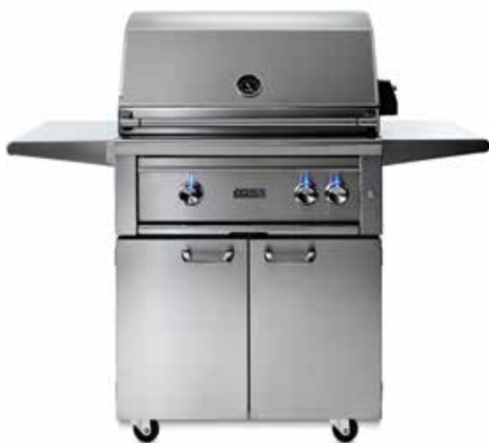
30" FREESTANDING GRILL