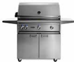
36" FREESTANDING GRILL L36TRF / L36ATRF