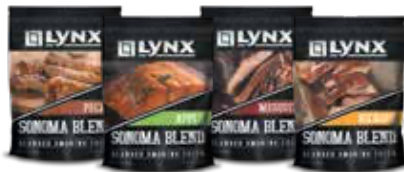
LYNX SONOMA BLEND SMOKING CHIPS