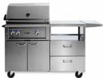
30" GRILL ON MOBILE KITCHEN CART L30 + LMKC54