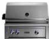
30" BUILT-IN GRILL L30R-3 / L30TR / L30ATR