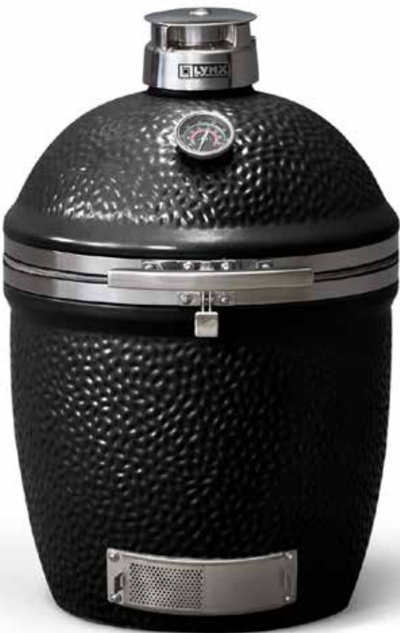
LYNX KAMADO GRILL IN BLACK FINISH SHOWN: LCGRBK