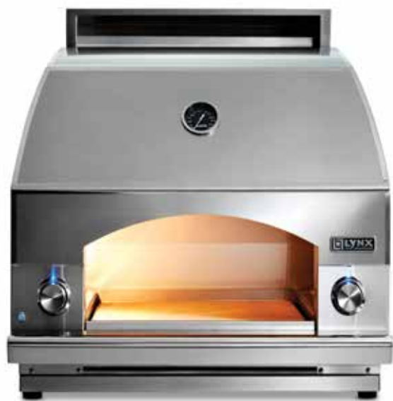
COUNTERTOP OR BUILT-IN