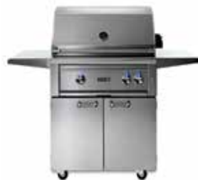
30" FREESTANDING GRILL L30TRF / L30ATRF