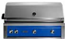
30"/36"/42"/54" Built-In Grills

Our new full-color control panels are available on a wide range of Lynx Professional products.