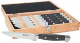
MODEL LSTK LYNX STEAK KNIFE SET

Lynx Accessories help compliment and complete your Lynx outdoor kitchen. Choose the final touches that complete your perfect picture. The details matter.