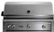
42" BUILT-IN GRILL L42TRF / L42TR / L42ATR