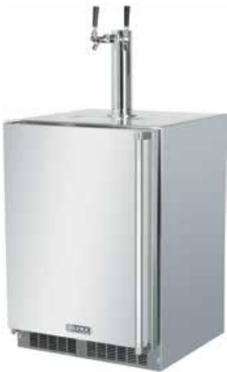
SHOWN: WITH OPTIONAL L24TWD