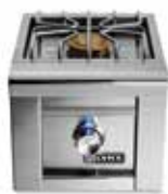
SINGLE SIDE BURNER