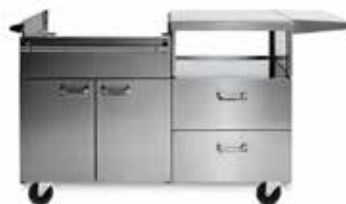
54" MOBILE KITCHEN CART LMKC54

NOTE: Must specify gas type—NG for Natural Gas or LP for Propane