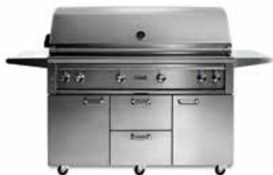
54" FREESTANDING GRILL L54TRF