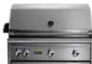
36" BUILT-IN GRILL L36R-3 / L36TR / L36ATR