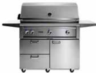
42" FREESTANDING GRILL L42TRF / L42ATRF