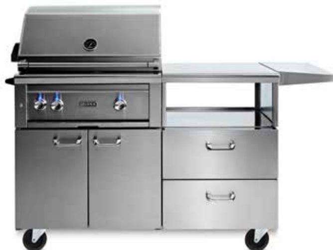
30" GRILL ON MOBILE KITCHEN CART