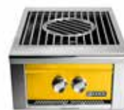
Professional Power Burner