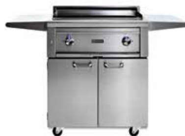
30" ASADO ON 30" MOBILE KITCHEN CART SHOWN: L30AG + L30CART. ASADO AND CART NEED TO BE ORDERED SEPARATELY (Assembly Required)