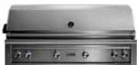
54" BUILT-IN GRILL L54TR

*LMKC54 can accommodate 30" grill head, Asado, and Napoli.