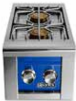
DOUBLE SIDE BURNER ECF: Pacific Blue