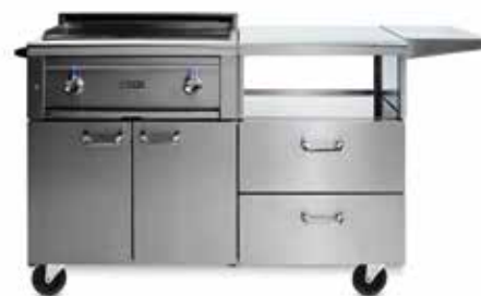
30" ASADO ON MOBILE KITCHEN CART SHOWN: L30AG + LMKC54. ASADO AND CART NEED TO BE ORDERED SEPARATELY (Assembly Required)